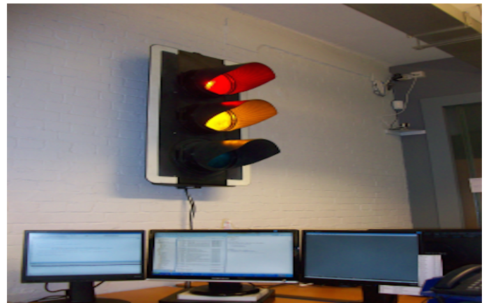
Fig. 2: Traffic light visualization for CI [4].

A development practice in Agile teams is continuous integration (CI). Since Agile teams work in small sprints, it is necessary for them to have working software everyday, and