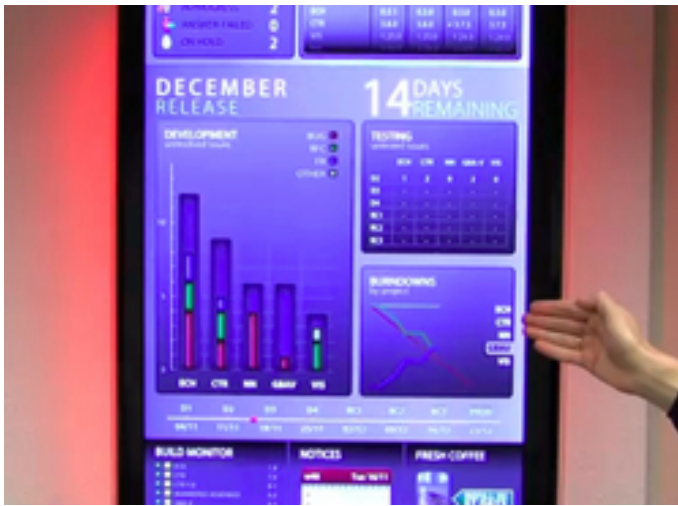
Fig. 3: Walle-D: An ambient display for agile developers [14].

information about the project. The benefit of using visualization techniques on dashboards is that they improve the sense of awareness and it prompts developers to act on the conflicts that arise. Awareness 2.0 provides a high level overview using visualizations to detect bottlenecks, deadlines and tasks, which is similar to the information provided by Agile walls. On the other hand, FASTDash is more local in the sense that it allows developers to understand the context on which they are working. FASTDash makes the team more efficient because it encourages communication between team members who are working on similar areas in the project.